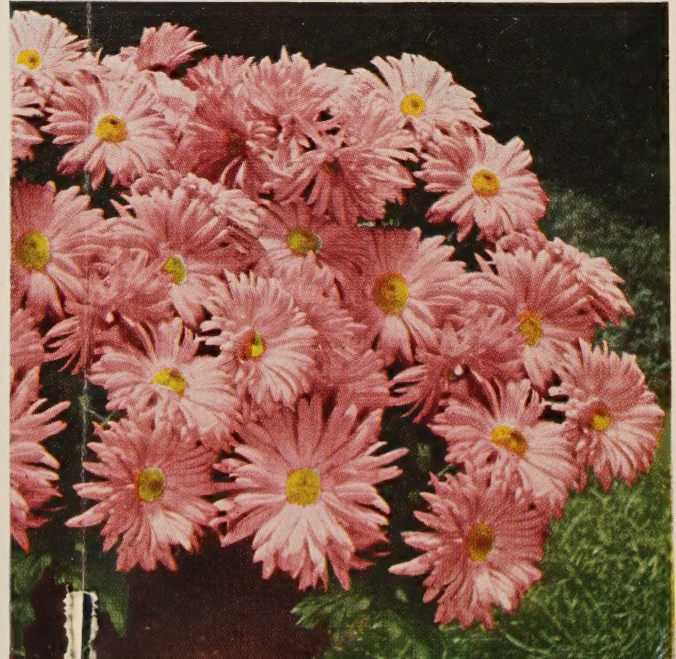
Pink Cushion Chrysanthemum